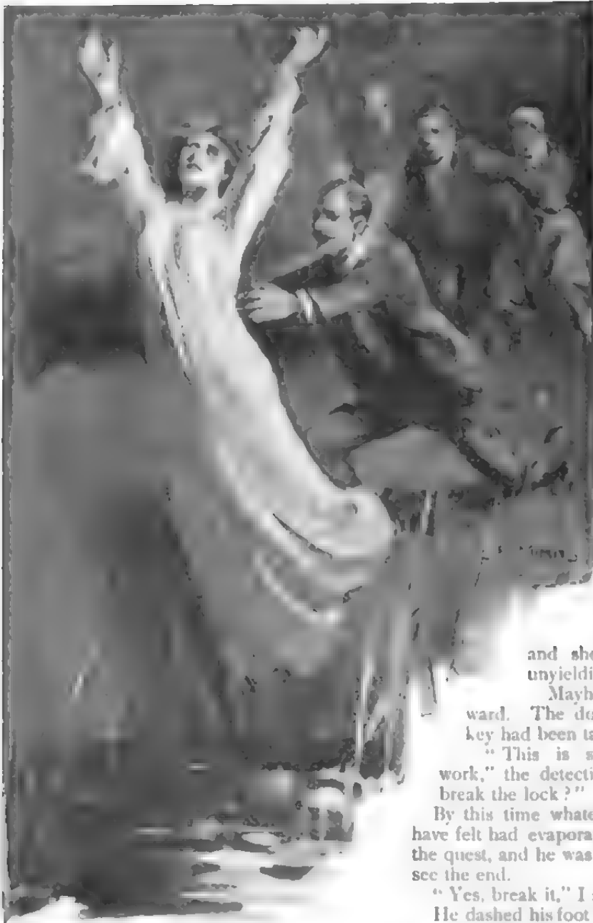
I sprang forward . . . Just in time to throw my arms round her as she reached the brink.

feet, an expression of amazement on his face.